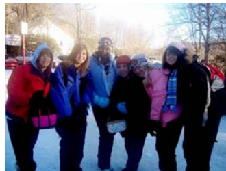
I suggest doing skiing if this is your first time because snowboarding is very difficult.

You will need to bring additional money to cover meals while traveling & for lunch on the mountain. We'll stop at fast food restaurants. A minimum of $45 should cover those meals. Each student will carry their additional money for traveling.